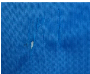
DO NOT USE

Each product should be inspected prior to use and with your six month or annual hoist inspection. This is in line with LOLER (Lifting Operations and Lifting Equipment Regulations). Please check the sling label.